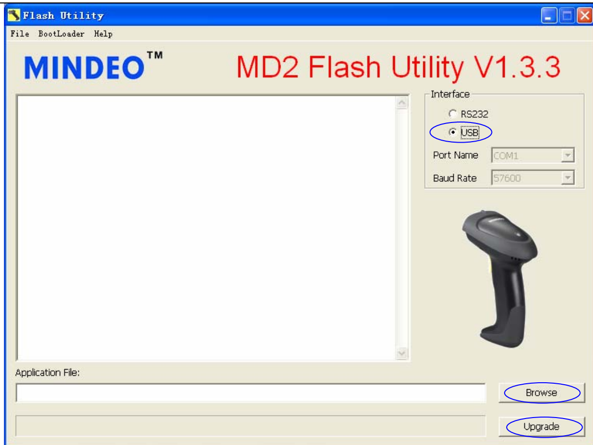
Fig.1 MD2 Flash Utility interface