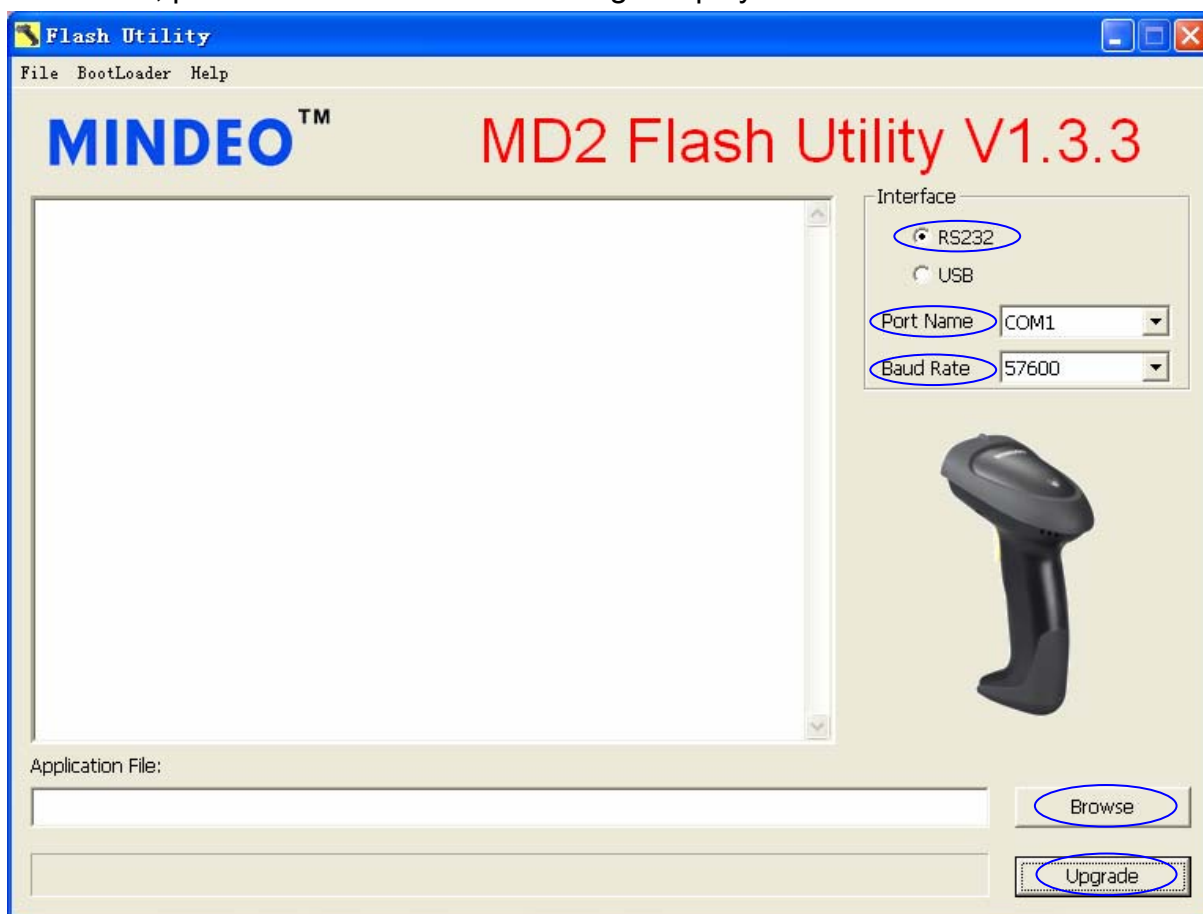
Fig.2 MD2 Flash Utility interface

the meantime the scanner will beep for three times. If the upgrading process is not successful, please refer to the error message displayed.